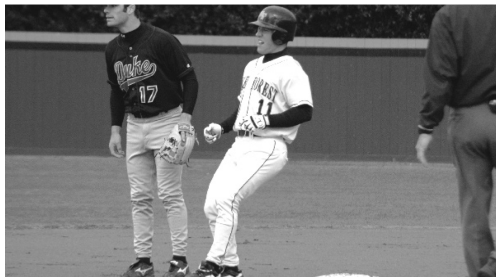
Nick Babladelis/Old Gold & Black

The Deacons, who improved to 14-16, 7-8 ACC, will next travel to Tallahassee, Fla. to take on Florida State. The game is scheduled for 7:00 p.m. April 8.