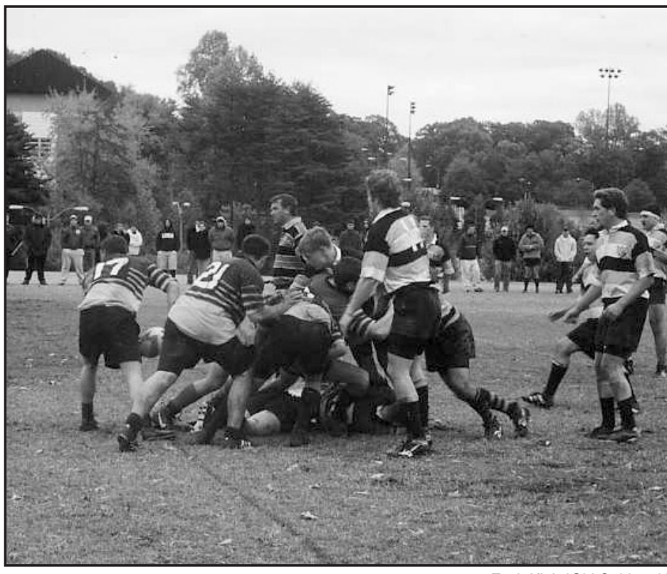
The Wake Forest Rugby Football Club rugby team is shown here in action against Elon College. The team is excited about the fall campaign.