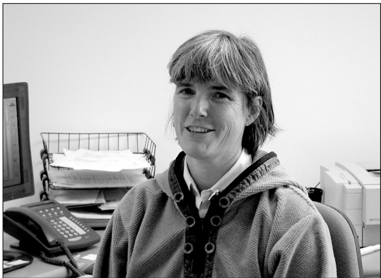
Max Langfitt/Old Gold and Black

President George W. Bush has denounced the work. The Senate is being pushed to pass legislation before the Christmas recess