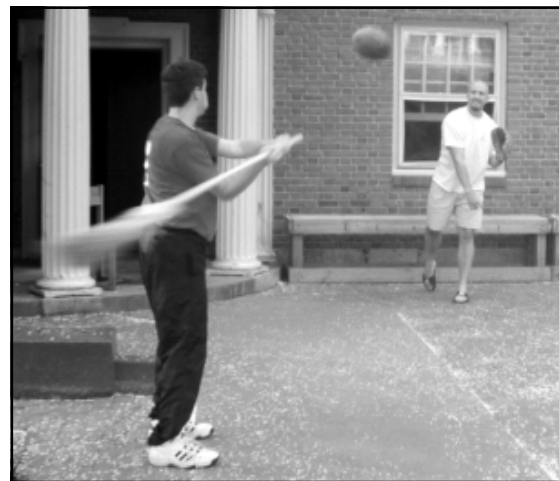
Amer Khan/ Old Gold and Black