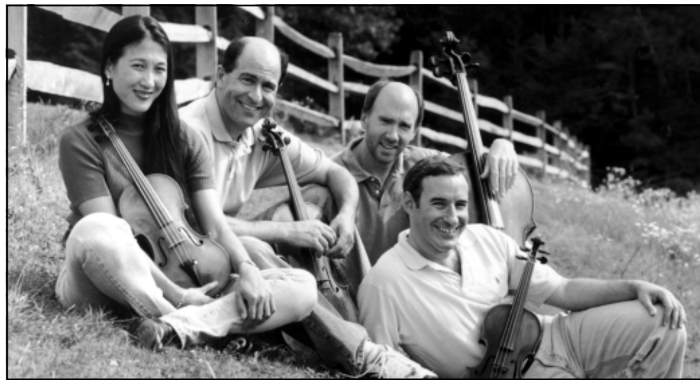
The Muir String Quartet gave a masterful performance of extraordinary pieces by Brahms and Mozart as part of the Secret Artist Series.

The Brahms B-flat Clarinet Quintet formed the second half of the program. Like the