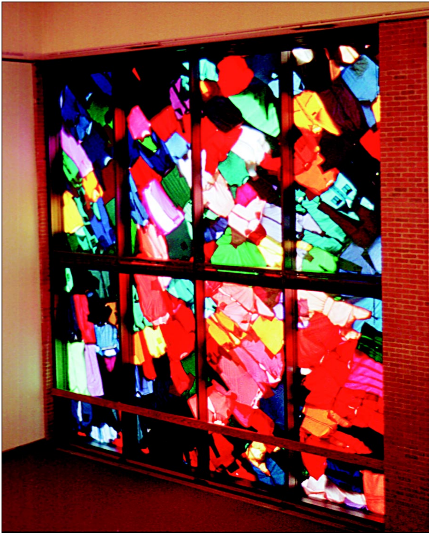
Noel Fox/ Old Gold and Black

When concentrating upon the yellow background, a subtle, realistic living room scene becomes ap-