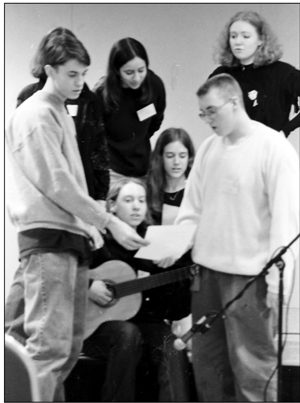
Students from the North Carolina School of Science and Math perform Feb. 21 as part of the Amnesty International conference.