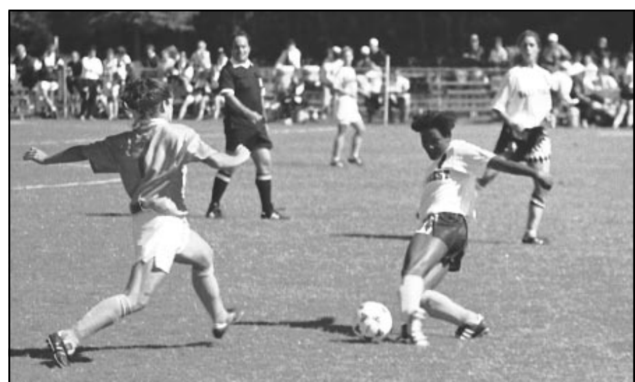
Old Gold and Black Photo

However, the Deacons were only toying with their opponents. Behind two goals from