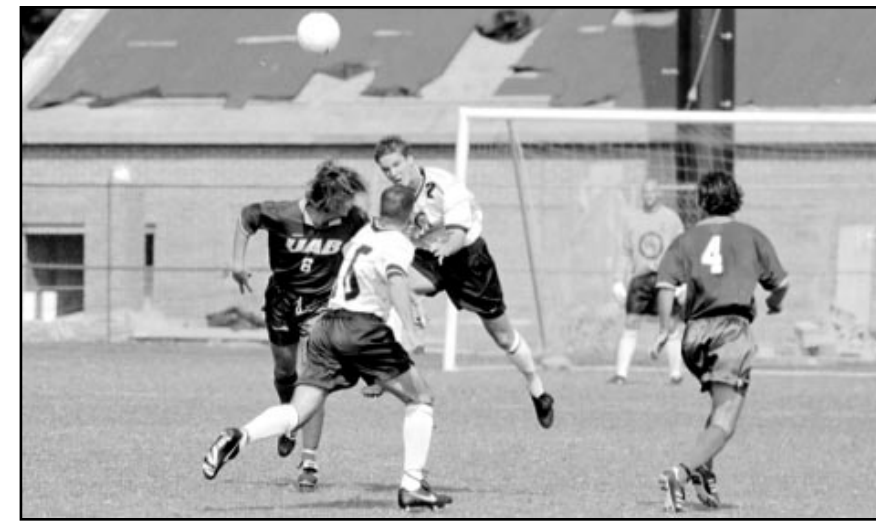
Two Deacons converge on the ball in a game earlier this season.

The Virginia game was supposed to be the first game played in Spry Stadium, but the opening will be delayed for another week or so due to damage done by Hurricane Fran.