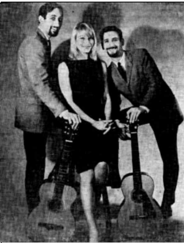
Peter, Paul, and Mary, a rising trio at the time, played Oct. 15, 1962 in the gymnasium