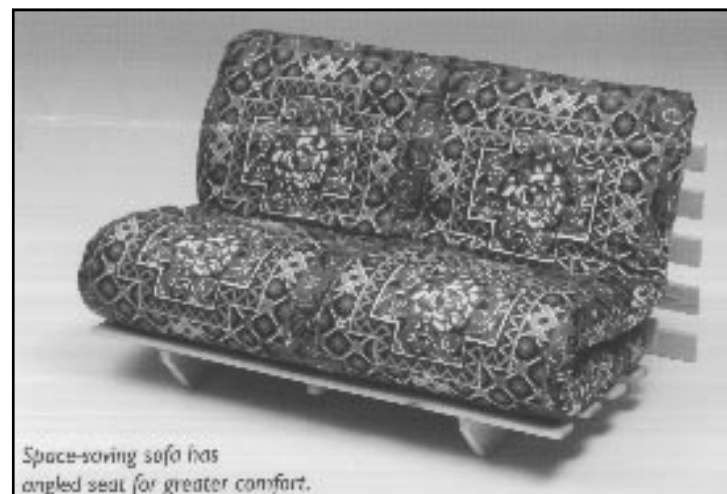
Space-saving sofa has angled seat for greater comfort.